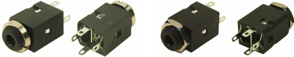
FC681375V WITH RING NUT

Stereo switched 3.5mm jack socket. Vertical PCB mounting. Supplied with ring nut or hex nut.